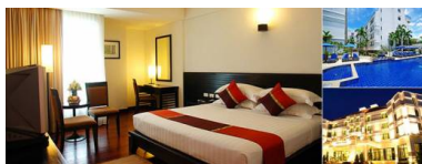
Tara Angkor Hotel_Room