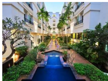
Tara Angkor Hotel_Reception