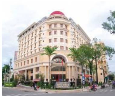
Ninh Keui Hotel

Accommodation: Ninh Keui Hotel for 1 nights