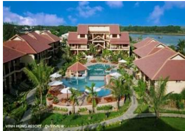
Vinh Hung Resort

Accommodation: Vinh Hung Resort for 2 nights