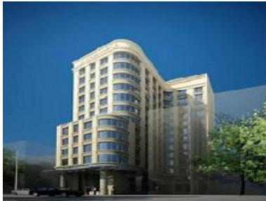
Liberty Central Hotel

Accommodation: Liberty Central Hotel for 2 nights