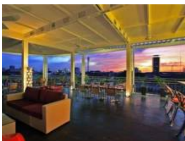
La Maison D'Ambre