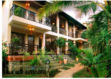
Vinh Hung Resort