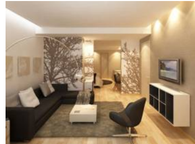
Liberty Central Hotel - Room