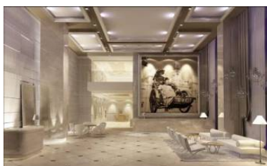
Liberty Central Hotel - Lobby