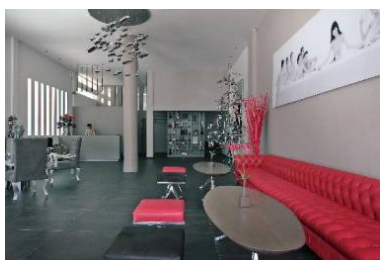
La Maison D'Ambre - Lobby