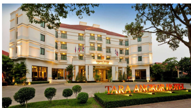
Tara Angkor Hotel