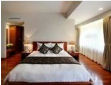
Deluxe Double Bedroom

The 4* Lan Vien Hotel is well-positioned in the Hoan Kiem District, an ideal point of departure for your excursions in Hanoi. Within easy reach are Museum Of Vietnamese Women, American Club and the Hanoi Opera House. The rooms offer a wide range of amenities such as air conditioning, mini bar, in room safe, internet access, hair dryer.