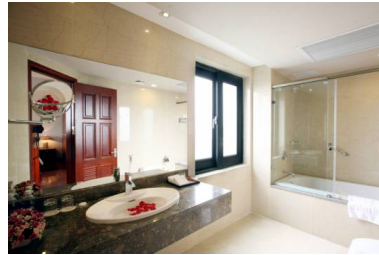
Deluxe En Suite/Bathroom