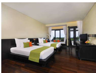
Luxurious Deluxe Suite