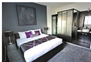
La Maison D'Ambre - Room