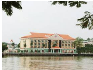
Ninh Keui Hotel