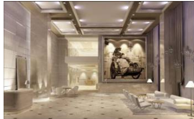
Liberty Central Hotel - Lobby