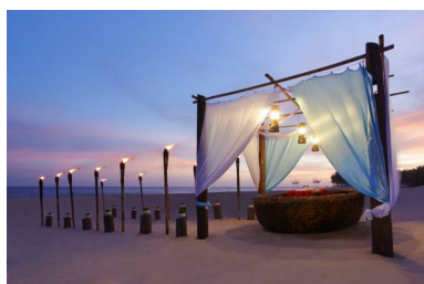
Anantara Mui Ne Resort

Accommodation: Anantara Mui Ne Resort for 3 nights