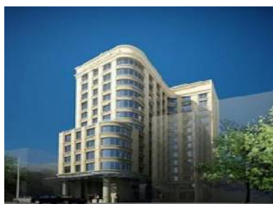
Liberty Central Hotel

Accommodation: Liberty Central Hotel for 2 nights