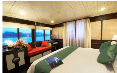
Bhaya Cruise - Cabin