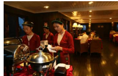
Bhaya Cruise - Dining